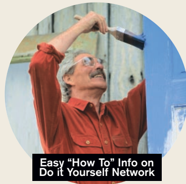
Easy "How To" Info on Do it Yourself Network