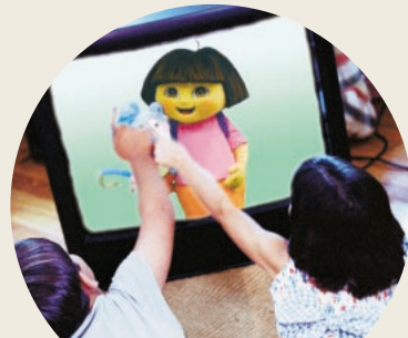
Entertainment for Kids on Nickelodeon

And when we want the latest news from around the country - or the world - we tune to CNN , CNBC , or Fox News Network .