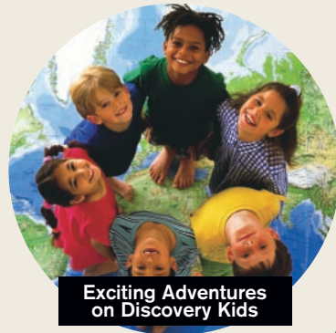
Exciting Adventures on Discovery Kids