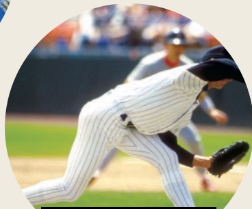
Major League Baseball on Fox Sports Net Florida