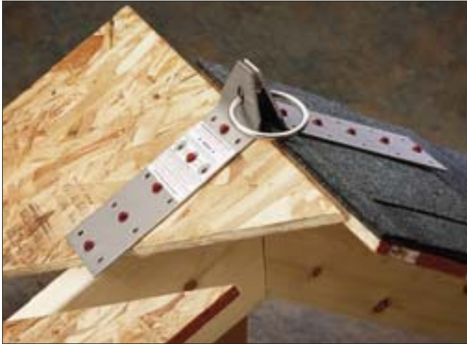
Attached to top chord using factory supplied hex head fasteners.

No other anchor has as many fastening options as the Universal. The Universal Anchor is a heavy-duty, 11 gauge stainless steel surface mounted anchor point. You have your choice of installing the anchor at the peak of the roof (up to a 12/12 pitch) or in the field using our hex head screws or duplex nails. Several different mounting options are made available to the user including: through sheathing into top chord, through sheathing only, or through existing roofing/sheathing. It is 100% component compatible with all of our Fall Arrestor® and Total Package® systems using either a carabiner or snap-hook attachment. Included with each anchor is a 6 page instruction manual detailing the different mounting options. The Universal Anchor is rated for fall arrest/fall restraint.