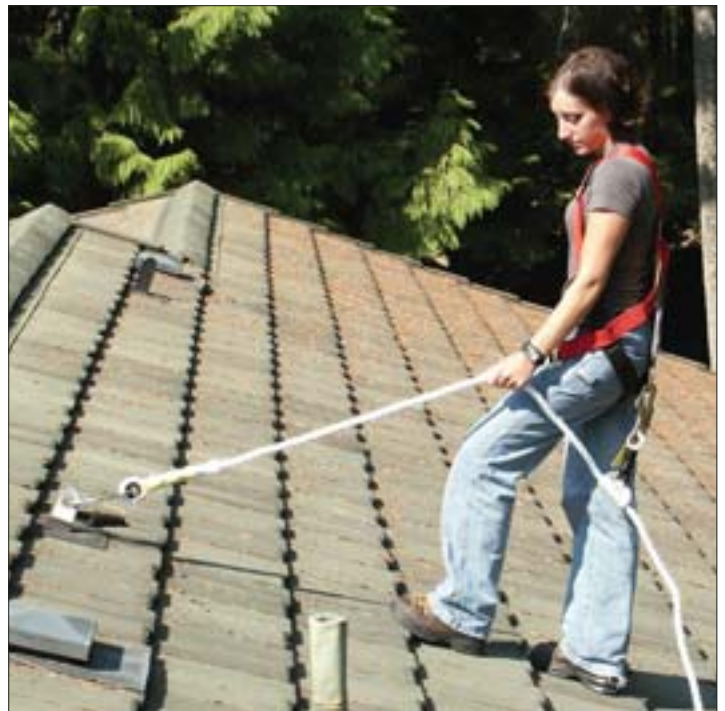
Value-Pak system features a 3 strand lifeline system.