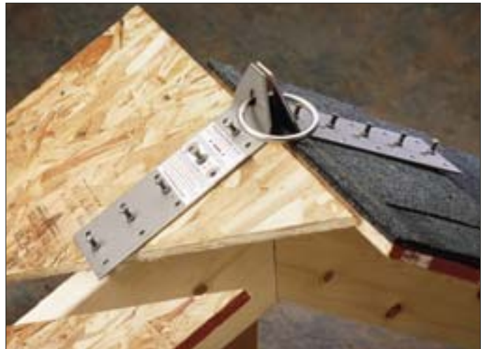
Installs quickly with our #2012 duplex nail fastener package, making it just as easy to remove.