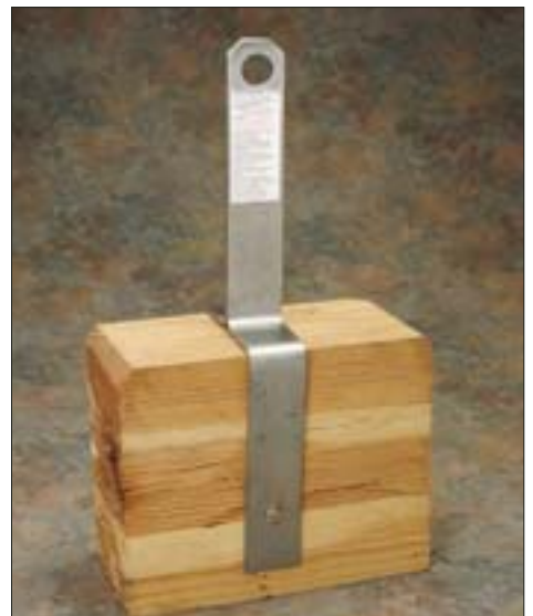
Structural wood beams are commonly specified for drill through attachment.

Custom sized anchors can be fabricated to attach to virtually any type of steel or wood framing member. Designs can be engineered for drilling through or bolting under the supporting member. Common application include Glue-Lam, Micro-Lam and structural wood beams, steel I-beams, steel I-joist, metal web I-joist, and steel trusses. To ensure a waterproof installation, anchor stem heights are designed to be used with metal decking, rigid insulation panels and built up roofing systems providing compatibility with any of our flashing bases and stem covers. Available in cold rolled or 304 stainless steel and supplied with grade 8 attachment bolts.