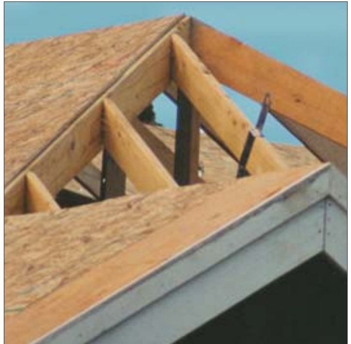
ARS 2x8 installs directly over top chord before sheathing is in place.