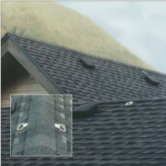
A single retro-fit anchor provides a flashing free anchorage that is accessible from both sides of the ridge. Low visibility can be achieved by painting to match the roof color.