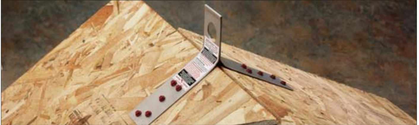
The 5K is rated for 5,000 lbs and is attached using 10 factory supplied hex head screws. Replacement fastener packages are available.

Here is an easy-to-install anchor that can be mounted at the ridge or in the field. The 18 gauge stainless steel 5K is durable enough to be used over and over. Preformed to fit an 8/12 pitch roof, the anchor can also be shaped to any degree, including flat. The 5K feature an attachment hole that allows all standard sized snaphooks and carabiners to be used. Rated for fall arrest.