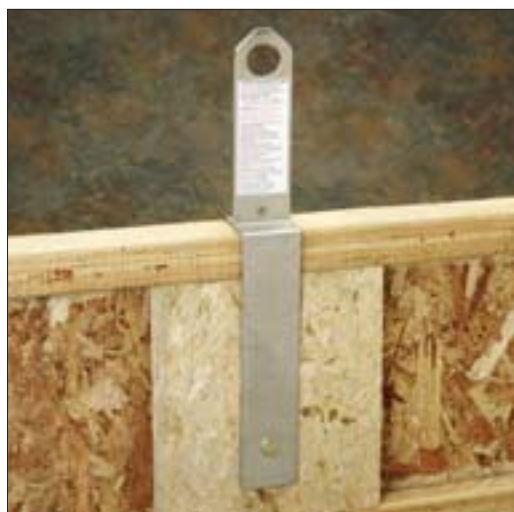
I-joist anchor attached to a top flange using a factory supplied bolt drilled through the web. Furring is required on both sides of the I-joist.