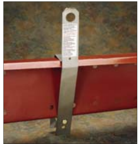
The Super Z-Purlin fits 8"x2.5" up to 9.5"x2.75" Purlins.

The anchor is engineered to fit all common size Z-Purlins, with custom sizes available upon request. Fabricated using 14 gauge stainless steel, our Super Z-Purlin anchor can be installed onto a purlin before or after erecting and will provide a safe tie-off during the construction period. But the real benefits are realized by workers who have to perform service or maintenance. Few surfaces are as dangerous as a high rib metal roof panel when it is icy, wet, or has an accumulation of algae. A cost effective solution to one of the industries most dangerous hazards. Supplied without caulking or flashing fasteners.