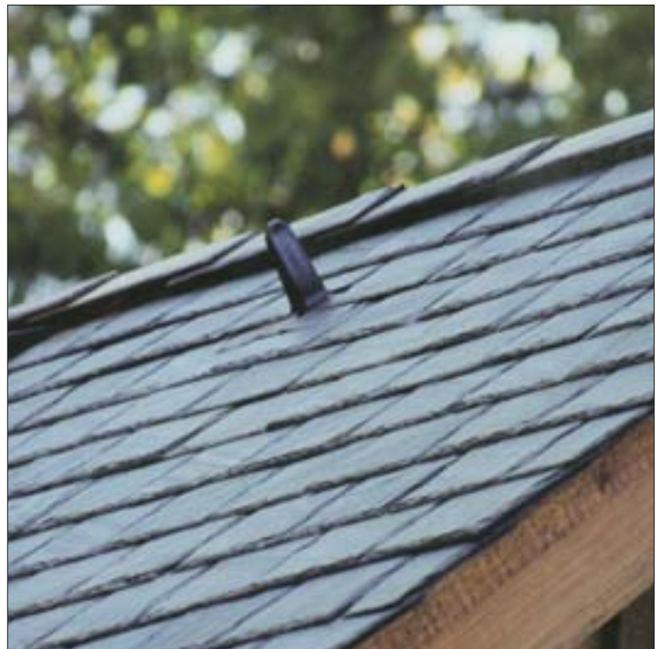
ARS 2x8 blends nicely with a slate roof using a lead based flashing. Shown with black stem cover. Gray and Terra-Cotta covers are also available.