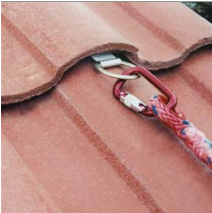
RS-20's unique design allows installation either in the pan or barrel section of high profile concrete roof tiles without using a flashing. May be painted to match tile color.