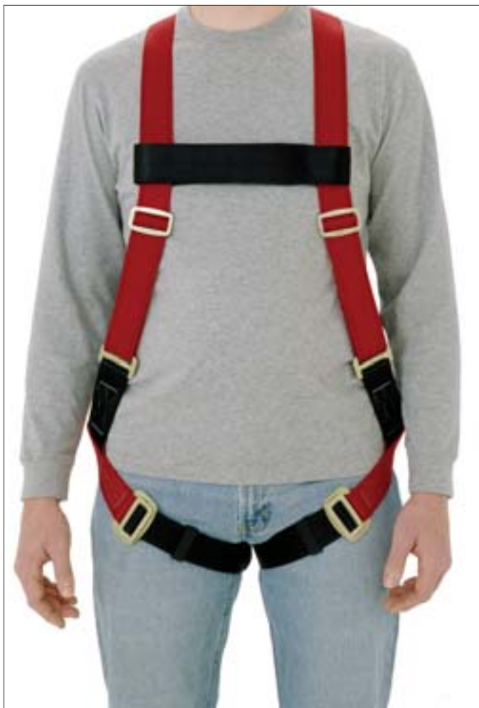
Our #6008 full body harness with a hook and loop chest strap.

The Fall Arrestor full body harness eliminates these annoyances by using a more streamlined design that takes up the excess webbing in the adjustment. We applied the same principle to our buckle-free hook and loop chest strap, a design that has been around for over 20 years. Ask anyone who has ever worn a Fall Arrestor harness, and they will tell you it's the most comfortable and easy to adjust harness that they have ever used. Available in Small, Large and X-large, our harness are pre-adjusted at the factory so they fit right out of the bag. And we offer a custom fabrication for those who require smaller or larger sizes.