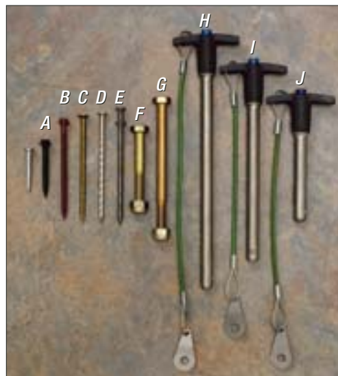
From left to right: A = #2011, B = #2009, C = #2014/2014-A, D = #2013/2013-A, E = #2012, F = #2006/2014, G = #2014-A, H = #2017, I = #2016, J = #2015.

Do not substitute with untested replacements.