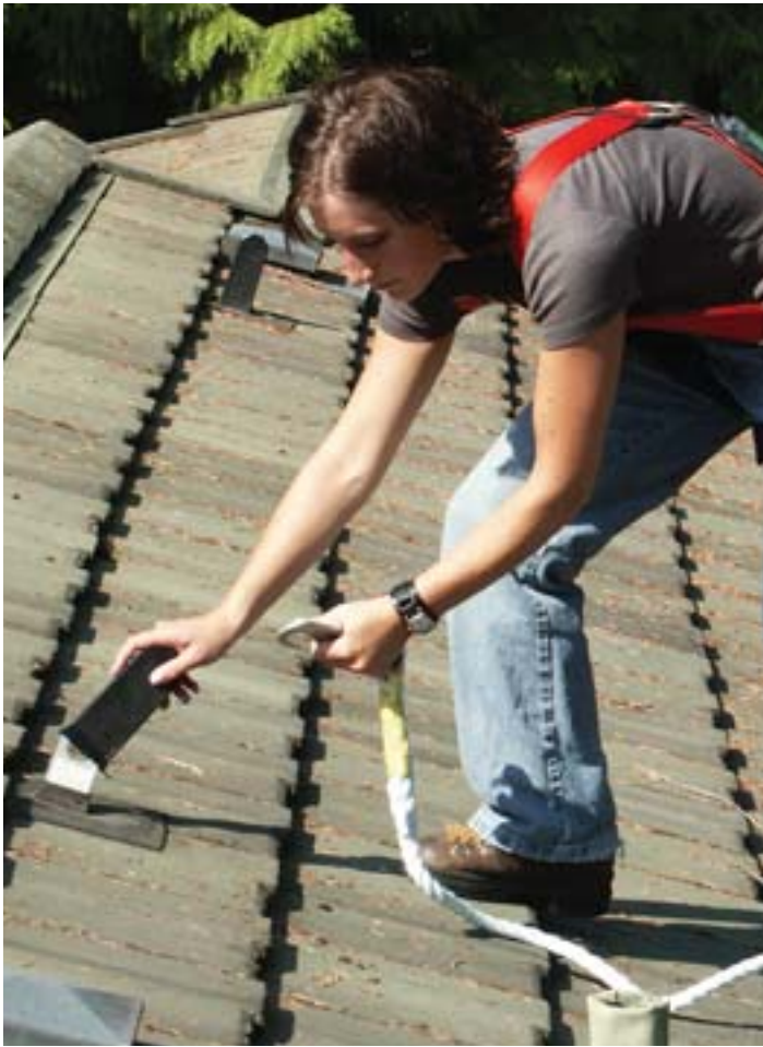
▲ Our Full Body Harness comes in a variety of sizes and fit both men and women. As seen here, safety is literally just a snap away with a properly installed anchor and our Value-Pak Harness/Lifeline System .