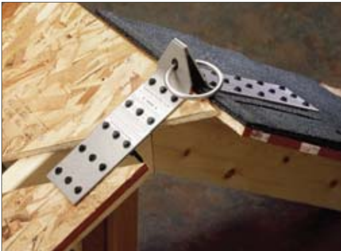
Using fastener package #2011, the Universal can be installed directly to the sheathing or over existing roofing without attaching to a top chord.