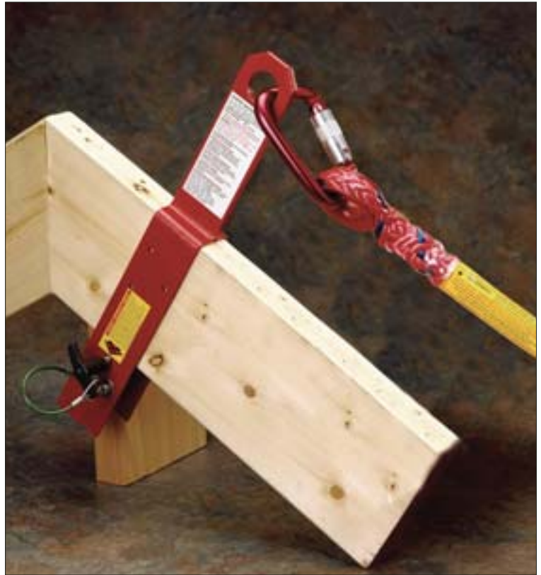
ARS Moveable Anchor shown on 2x6 top chord.

Nothing works better to fill the fall protection gap than our ARS Moveable Anchor . Ideal for times when you don't have a permanent anchor available, or when performing work with limited duration fall hazards. The ARS Moveable is made from 11 gauge stainless steel and is powder coated red for high visibility. The attachment device is a high quality aircraft grade 3/8" diameter stainless steel detent locking pin with a T-handle. It is durable enough to stand up to the kind of abuse common in the construction environment. The ARS Moveable Anchor can be used for fall restraint or fall arrest and is available in two sizes that attach to the five top chord dimensions used in wood framing. Another valuable tool and a "must have" to add to your collection of fall protection equipment.