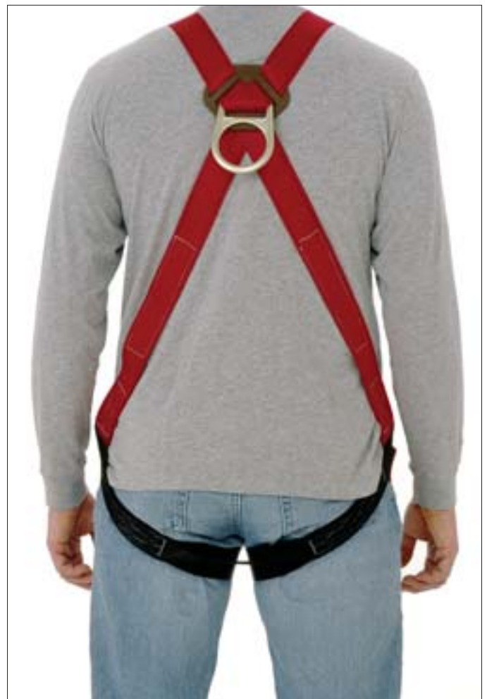
Our #6035 full body harness showing rear D-ring placement.