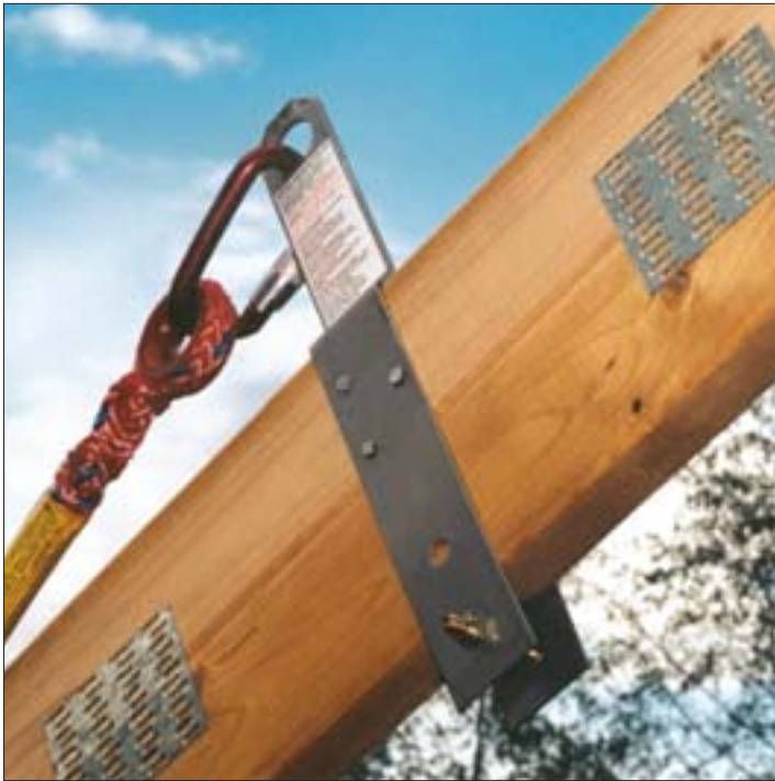
ARS 2x8 is easily installed onto a 2x4 top chord at the truss factory by using a single attachment bolt under the 2x4 blocking.