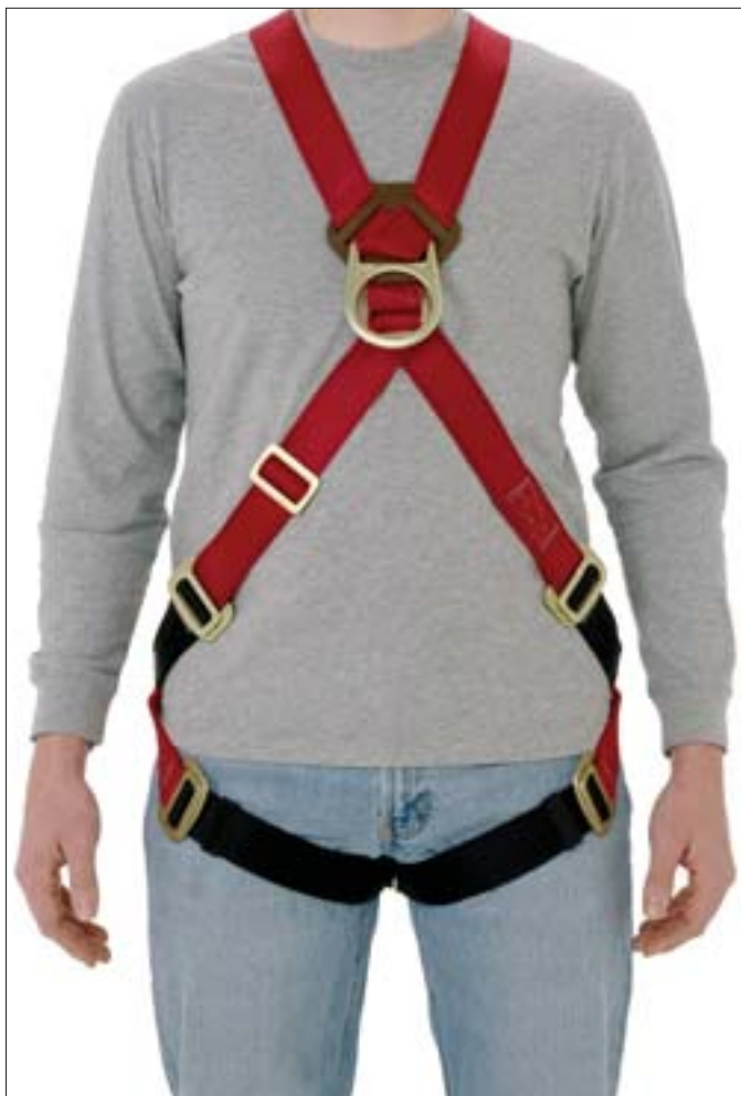
Our #6035 Full Body Harness showing front D-ring placement.