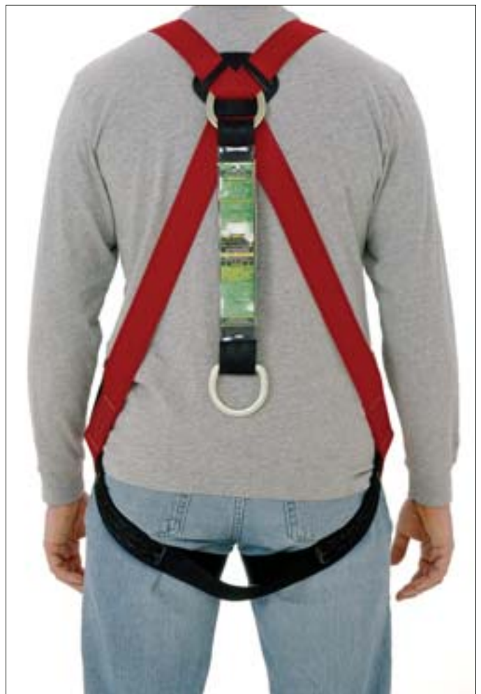
Our #6008 full body harness with integral shock absorber.