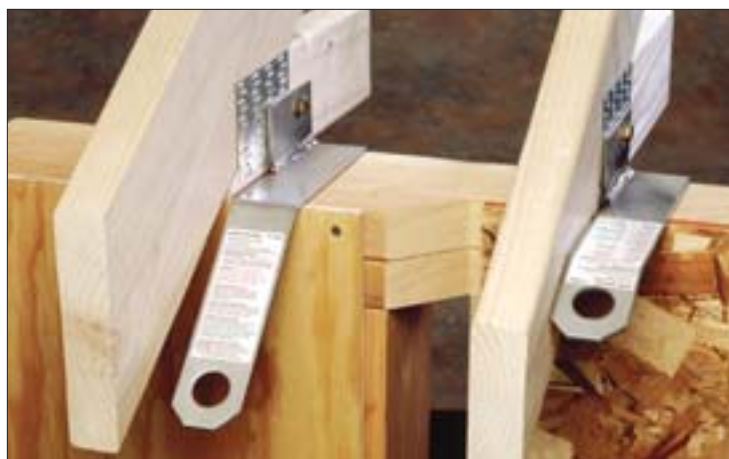
On the left, #1004-A 45° is attached to a 2x6 top plate. On the right, #1004 is attached to a 2x4 top plate shown above low pitched roof.

Siding and related external wall construction, such as window installation and painting, expose workers to an even greater risk than working on elevated surfaces such as the roof. Falls from scaffolding and especially ladders, accounts for more serious injuries than any other job site hazard. Vertical Wall Anchors provide an easy cost effective way to provide protection that can be left in place or removed from service. The low visibility anchor stem comes in two standard configurations allowing a wide range of installation options. Attaches by drilling through the top chord and securing to the wall plate using 4 16d sinkers. The anchor is supplied with all necessary fasteners. Designed to accommodate the bird blocking component on low or steep slopes and fabricated using 1/8" thick stainless steel.