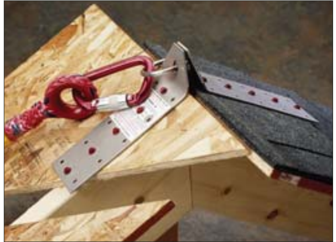
The attachment ring is sized to fit all common size snaphooks and carabiners.