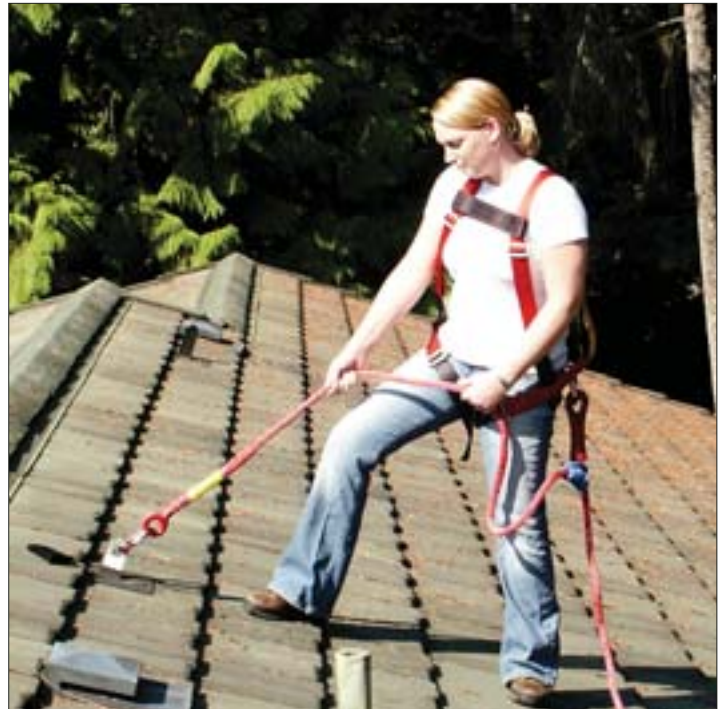
Total Package Deluxe utilizes a 12 strand colored lifeline.