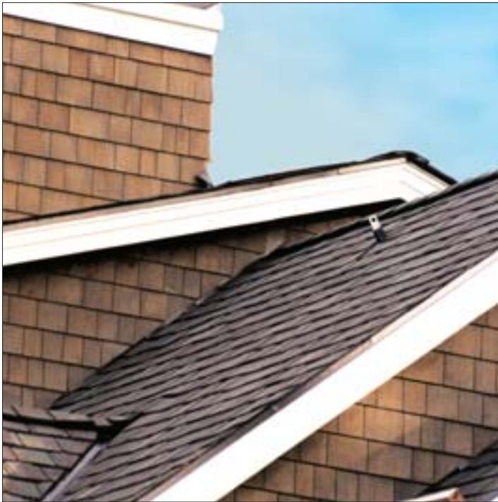
Service and maintenance personnel easily attach to the ARS 2x8 by removing the stem cover. Shown flashed into an asphalt shingle roof with the standard Santoprene base.