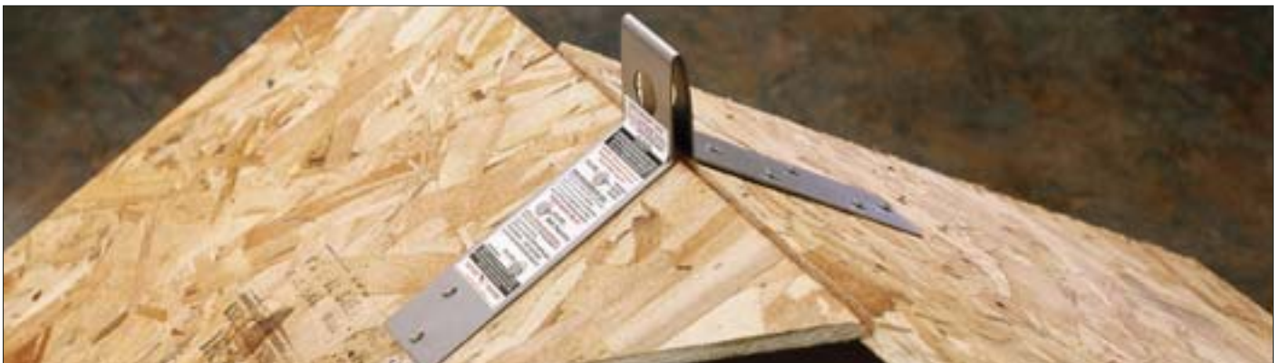
The 3K is installed easily using a hammer and 10 factory supplied nails.

The 3K is a disposable and cost effective device that can be installed with a hammer and nails when a permanent anchor is not available. Used primarily by service trades like roofing material suppliers. The 3-K can also be used to secure a ladder to keep it from falling. Pre-formed to fit a 5/12 pitched roof, the 16 gauge steel anchor is easily adjusted to any degree. To abandon, simply flatten and roof over. Like the 5-K, the attachment hole will accept all standard sized snap hooks and carabiners. Supplied in 12 packs with fasteners.