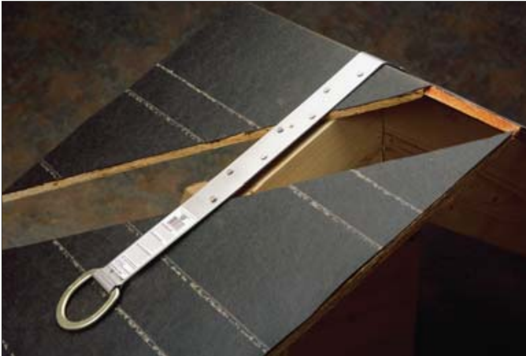
Anchor is centered over top chord through roof sheathing.