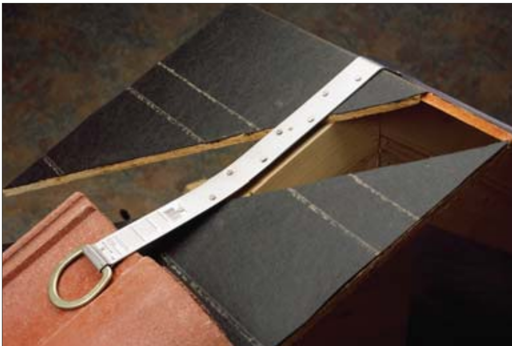
Installed over the ridge and on top of the tile head-lap.