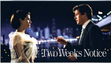
Two Weeks Notice on HBO® in December.