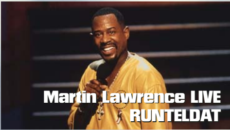
Comic actor Martin Lawrence returns to his stand-up roots on Showtime in Dec. with this hilariously confessional concert.